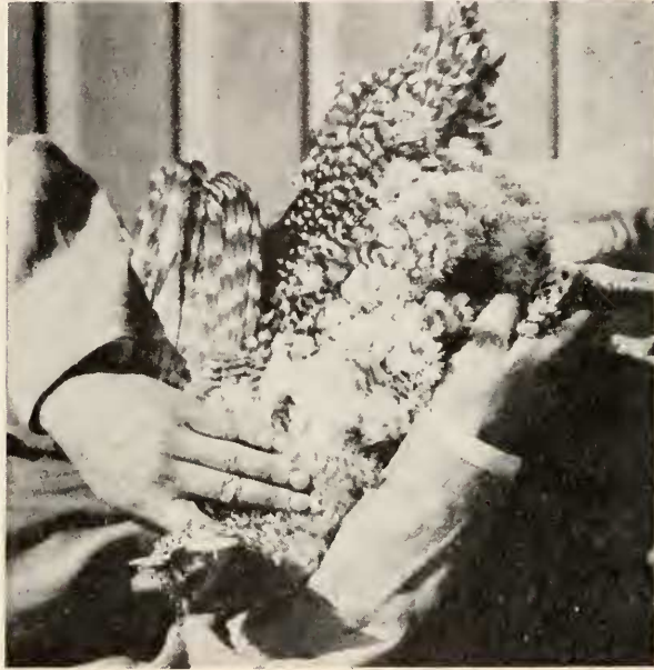
FIG. 3. Hen 4101 showing depigmented feathers under left wing (also abundant under right wing and on back). After subsequent molt, feathers in these same areas were normally barred when observed, Aug. 30, 1926.

after thyroid administration. Feathers 2 to 5 (Fig. 2) are completely silky in appearance, there being on observation with the naked eye no apparent interlocking of barbules on adjacent barbs as illustrated and described by Lloyd-Jones (1915). Feathers 6 and 7 show a slight interlocking close to the shaft at its distal end.